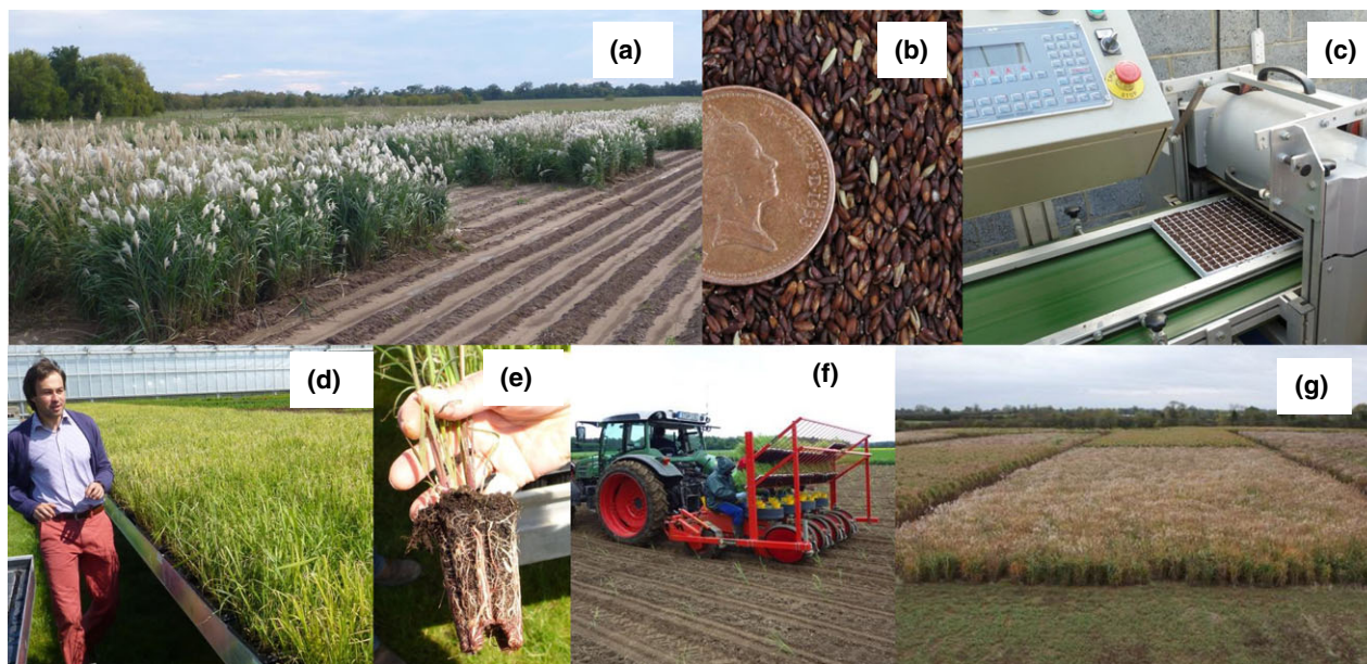
Fig. 1 Steps taken to develop seed-based Miscanthus hybrids: (a) Field seed production trials in CERES, USA. (b) Threshed Miscanthus sinensis seed with a British pound coin for scale. (c) High throughput plug sowing. (d) Dr. Michal Mos, checking plugs which are hardening for field planting in Lincoln. (e) A field-ready plug. (f) Mechanical planting of plugs with a Unitrium plug planter in Stuttgart, Germany. (g) Large-scale replicated 0.25 ha plot trials in Lincoln, UK.

The chances of seedling establishment in the temperate zones can be improved by covering the seed bed after sowing with photodegradable transparent polymer mulch films, as is used for maize (Keane et al. , 2003). These film coverings create conditions conducive to