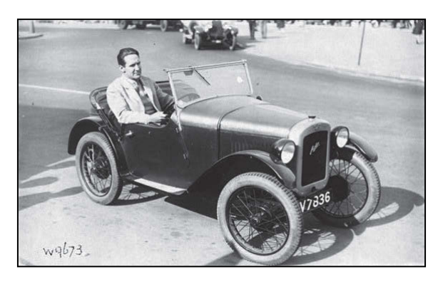
Figure 1 James Madison Carpenter Sitting in an Austin Roadster The James Madison Carpenter Collection, Archive of Folk Culture, American Folklife Center, Library of Congress, AFC 1972/001 Photo 101

James Madison Carpenter (1888–1984) was a Harvard-trained collector who, between 1928 and 1935, amassed a vast hoard of British songs, stories, tunes and customs (see Figure 1). He was one of the few field workers active in Britain during this period, and his collection is notable for its breadth and diversity. Carpenter's collection was bought by the Library of Congress in 1972, at the instigation of Alan Jabbour, then Director of the American Folklife Center, where it is now held as collection AFC1972001. Shortly after acquisition, the material was removed from the mail sacks, boxes, and packets in which it arrived. The manuscripts were microfilmed and the disc recordings were copied onto tape, but the collection was not catalogued. However, a recent and ongoing international project, of which I am a part, has produced an in-depth on line finding aid¹ and, in doing so, has brought this vast multi-media collection to the attention of a wider audience, and facilitated its use. The long term goal of this project is to fulfil Carpenter's wish to publish his collection by issuing a critical edition of its contents, and to this end we have transcribed many tracks from Carpenter's sound recordings.