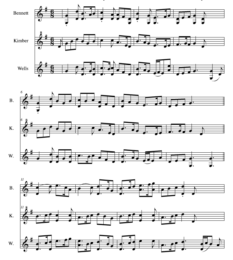
Figure 5 Parallel notation of 'Constant Billy'

analogue to the fiddler's double stops and drones. In Kimber's rendition of 'Constant Billy' (see Figure 6), both techniques are employed to give a feeling of bounce to the tune and to emphasize the rhythm. For Kimber and Bennett, the added accent and lift from the extra notes over-rode any desire for 'sweet' harmony.