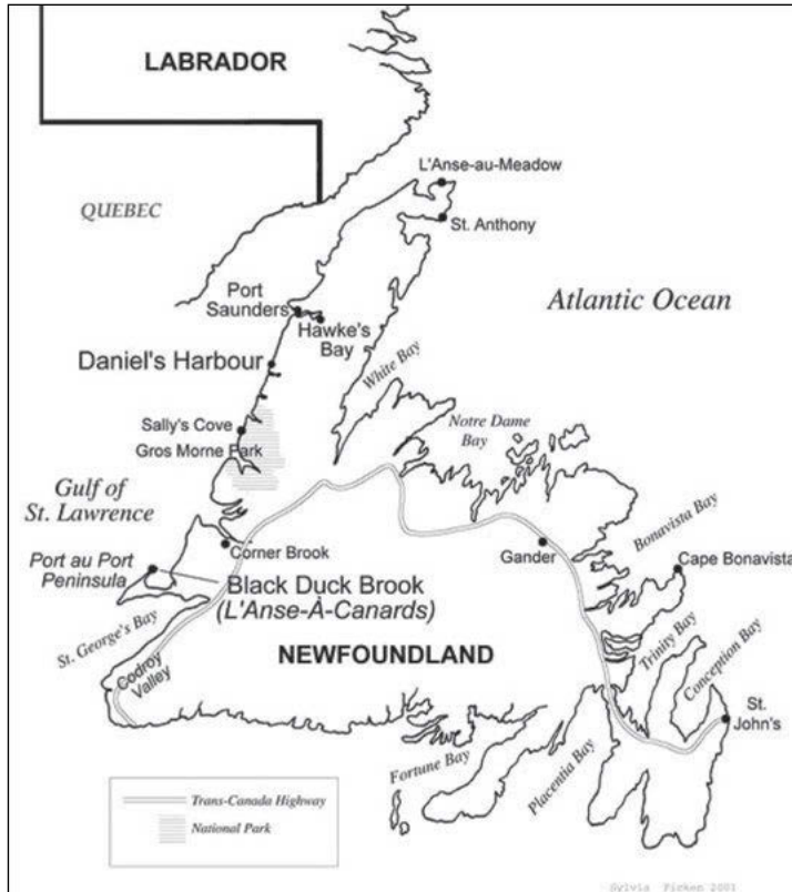
Figure 1 Newfoundland

Perhaps due to their isolation, the people of Newfoundland held onto many of the older traditions from the British Isles. Up until recently, the traditional a cappella songs were still very much alive. Several folk song collectors, including Maud Karpeles, visited the island and published song books. 4 Kenneth Peacock, who visited the province throughout the 1950s and 1960s, published the largest work, a three-volume collection called Songs of the Newfoundland Outports . 5