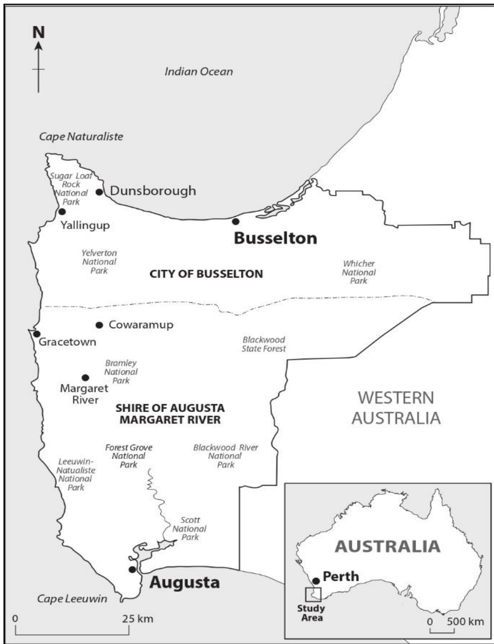
Figure 1. The Margaret River region in Western Australia.

In the late 20 th century the MRR also became an attractive destination for various new residents (Sanders, 2006). The region witnessed an impressive increase in population from 13,049 in 1981 to 31,911 in 2001, and it has since maintained a steady demographic growth (Sanders, 2006). Tourism in the MRR plays an important role as a regional economic driver and a source of direct and indirect employment for around 20% of the region’s population (MRBTA, 2019). It suffices to say, in 2018-2019 the MRR received 2.89 million domestic and international visitors (1.30 million day-trippers and 1.59 million overnight visitors). In