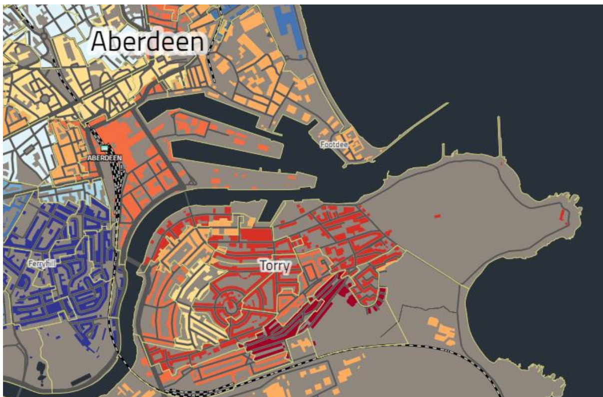
Figure 1. Scottish Index of Multiple Deprivation showing Torry in red for 10-20% most deprived.

The 1970s oil discovery in the North Sea revolutionised the UK as a source of energy security and has carved Aberdeen's economic, political, and cultural identity as the 'oil capital of Europe'. Torry, an area and community historically based around fishing and boat building within the city, sits beside the oil Port of Aberdeen, formerly known as Aberdeen Harbour (Energy Voice, 2022). It has taken the weight of industrial development for the city. When oil arrived in the 1970s, the houses of what was formally known as "Old Torry" from the fishing community was requisitioned for oil and gas infrastructure and now the new port development to support oil and gas and cruise liners to the city situated at Nigg Bay (Aberdeen Harbour, 2020). Torry is an area that suffers from economic, health-related and social inequality; it is identified as being one of the most deprived areas in the city of Aberdeen (Scottish Government, 2020; see Figure 1 below).