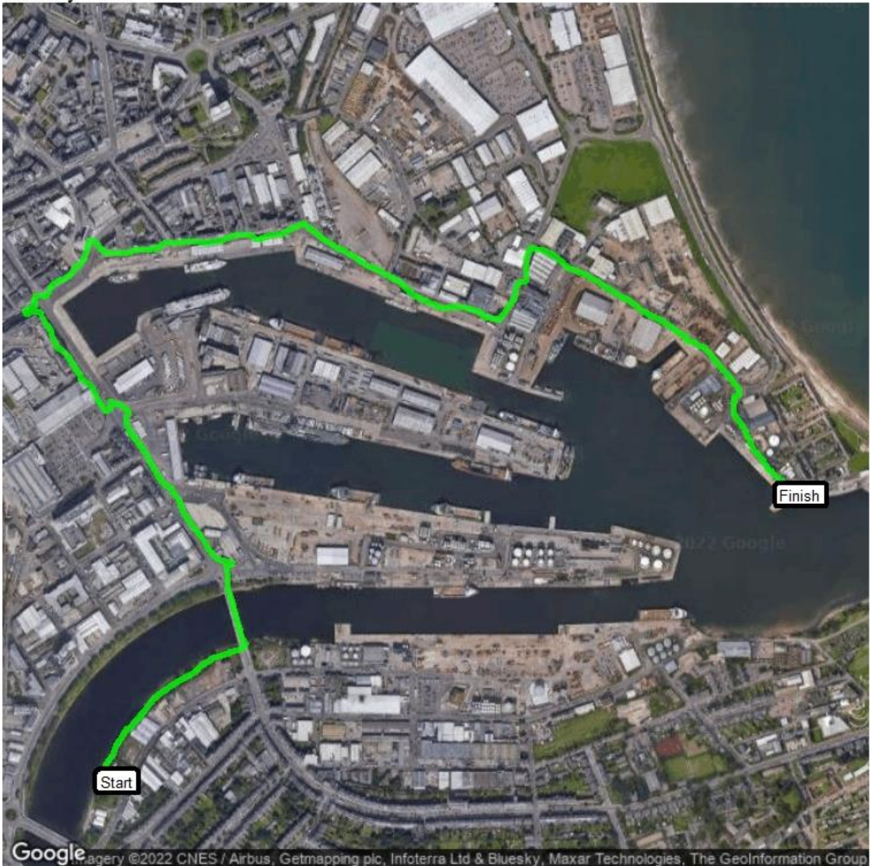
Figure 3. Sensory walk map 1 showing the inner-city position of the Port of Aberdeen.