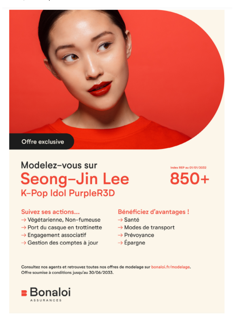
Figure 3. This design fiction illustrates a speculative 2032, when people's reputation is "data-driven" and provides access to jobs and services. This design fiction is an ad for the "Bonaloi insurance" company: its latest offer proposes to index one's behaviour on that of a K-Pop idol to boost one's reputation and thereby benefit from insurance rate discounts. Translation of the French text: Exclusive offer. Model yourself on Seong-Jin Lee, K-Pop Idol PurpleR3D. Index REP on 01/01/2032 850 +. Follow her actions...Vegetarian, non-smoker; helmet use on the micro-scooter; associative commitment; Up-to-date profile management. Benefit from advantages! Healthcare; transport; pension; savings. Consult with our agents and find all our modelling offers on bonaloi.fr/modelage. Offer subject to conditions until 30/06/2033.

launched in September 2020. Responding participants (i.e., Casus Ludi, Chronos and the Plurality University Network) were asked to explore and share imaginations from fictional works relating to how life and data protection could be like in 2030. These visions of future possibilities were rather meant to hint to plural imaginaries that cover different aspects (e.g., rural world vs. urban world). The fragments, i.e., significant excerpts from complete works, served as material for the production of design fiction artefacts by the Innovation and Foresight team (Figures 2 and 3). Such a collection was then analysed and published in a report (Courmont et al., 2021).