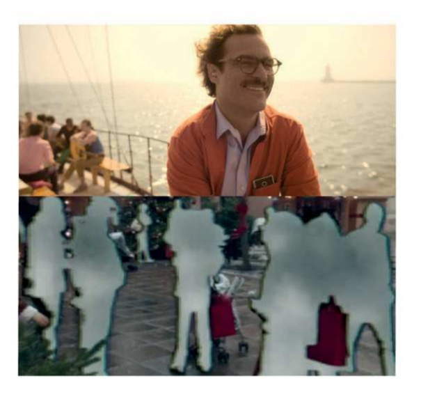
Figure 4. This fragment of fiction was used in a workshop where the participants had to prototype an imaginary service in "The city as an experience". The questions that were raised were: How could technologies modify the perception of the city? How might public services become more responsive and reliable? What would be the business models to improve the user experience? Translation of the French text: Dystopian inspirations - science-fiction. 1. The isolation caused by the ultra-personal assistant of the movie "Her" (Spike Jonze, 2013). 2. The possibility of being blocked by all citizens thanks to Virtual Reality in "Black Mirror - White Christmas" (Carl Tibbetts, 2014).

– 2 La possibilité d'être bloqué par l'ensemble des citoyens grâce à la réalité augmentée dans Black Mirror - White Christmas