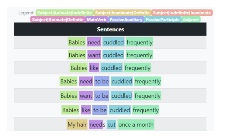
Fig. 2 Example of the annotations depicted by Linguists

component. The researcher is provided with an access link, which sent to Participants to complete the survey. Our platform stores the Participants ' answers on its completion. The researcher can then explore the Survey Results . Theoretically, existing survey systems could potentially be reused as a survey component in our architecture.