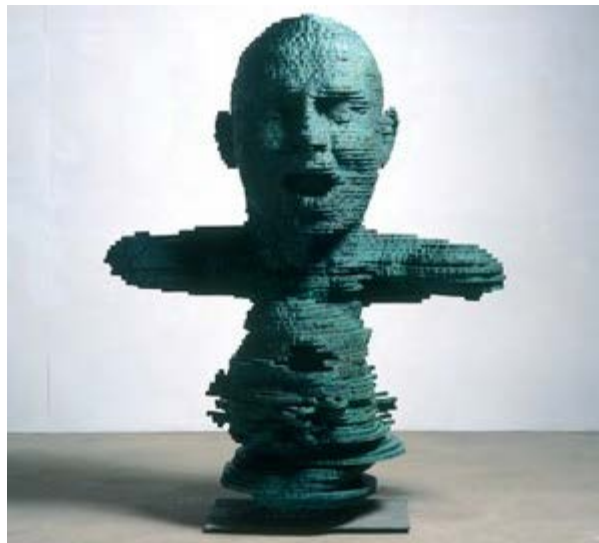
Eco 2004, Bronze Casting 230 x 185 x 110 cm.

Two specular bronze heads form the sculpture Eco (2004).