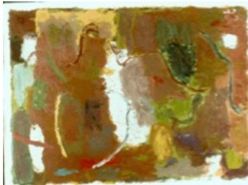
Brodsky, Stan. Naucelle #3 . 1999.