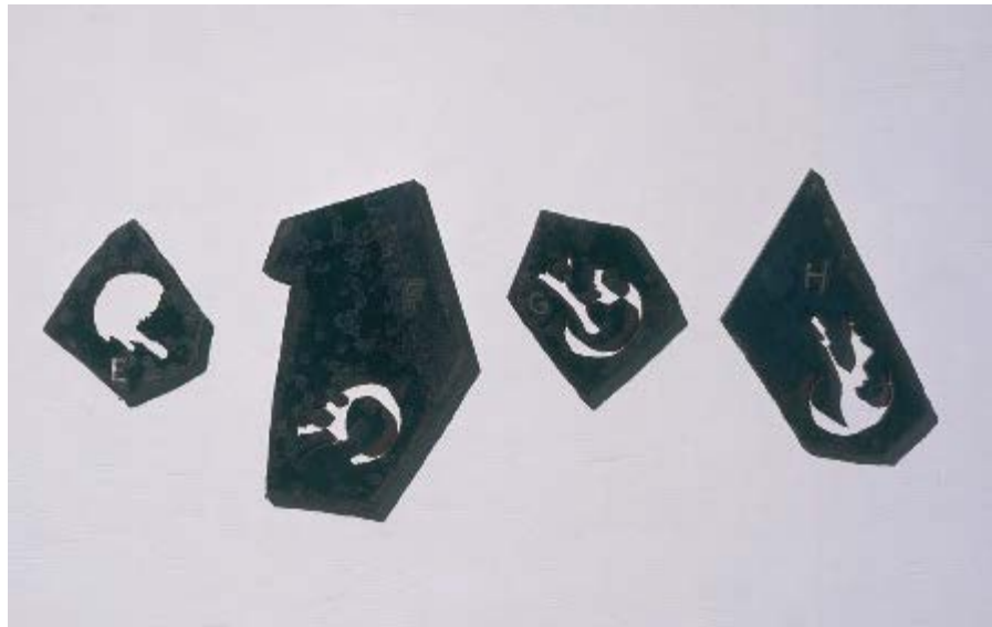
Teschio-Alfabeto 2007, Steel. Twenty-six elements: various dimensions.

The oscillation between the two practices of seeing and reading an image parallels the understanding of the image as an image and/or as a tracing. Not only does representation become a process of tracing, but the image itself is an embodied tracing of signals. MRI is an “ex-scriptive” imaging technology that externalizes the interior of the body in the form of traces projected on a screen. [36] The notion of tracing becomes central for the understanding of how the MRI image-data function without being new in the history and practice of ways of seeing. Tracing takes us back to the experiments led by the French physiologist Étienne-Jules Marey as well as to several 1920s experiments pursued by avant-garde artists such as Len Lye and Hans Richter, whose works clearly attempt to overcome the notion of image as representation. MRI images challenge us to reconsider the status and function of the image as an artifact to be seen or to be read. Aesthetics comes into play at a three-fold intersection between practices in the laboratory and artistic ones carried out to create images and the interpretation of these images, and referring to both to medical discourse and aesthetic parameters.