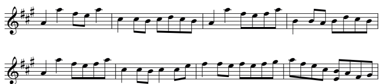
Figure 1 The ‘bare bones’ of the B part of ‘Miss McLeod’. Embellishment applied, the second time round (B3).

The reel, ‘Miss McLeod’, was used by Boyle to demonstrate his approach to embellishments (see Figures 1). The first time round the tune he plays it simply, then he ‘puts the beef on it’.