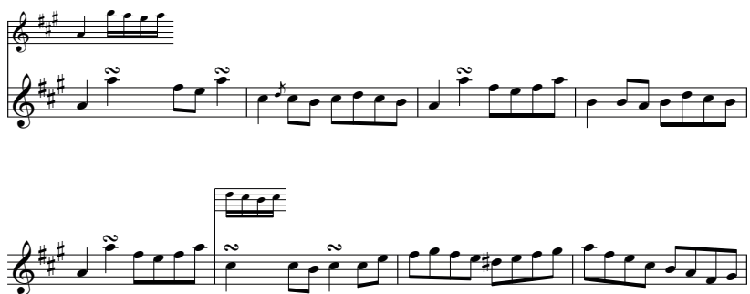
Figure 2 Here, Néillidh’s use of the short roll on the A and C#, along with the use of grace notes, allow for melodic variation and a very precise articulation through ornamentation. Boyle’s use of embellishments is systemic in the rest of the tune, and he varies there use for further melodic variation. Thus, the phrase is played differently the third time round the tune (B5).