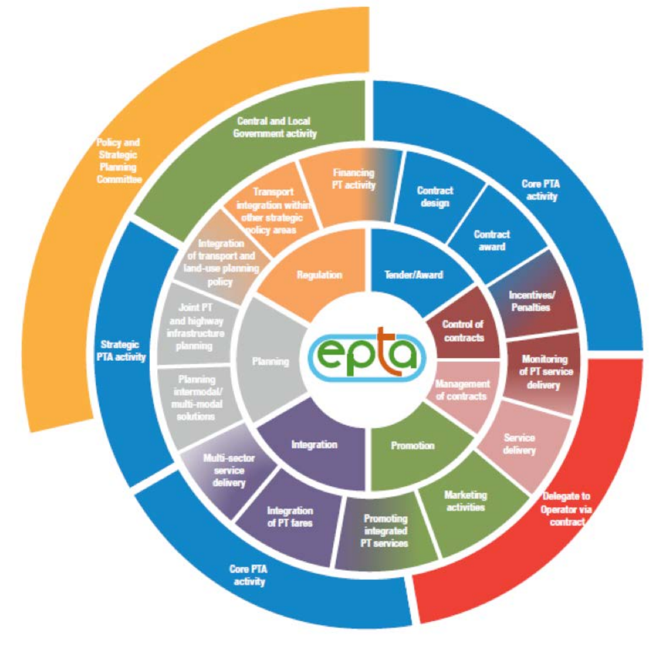
FIGURE 3. Model for PTA in medium or small city

Based on the above findings and recommendations from the EPTA Project, Figure 3 illustrates the PTA model for a small rural to medium urban area.