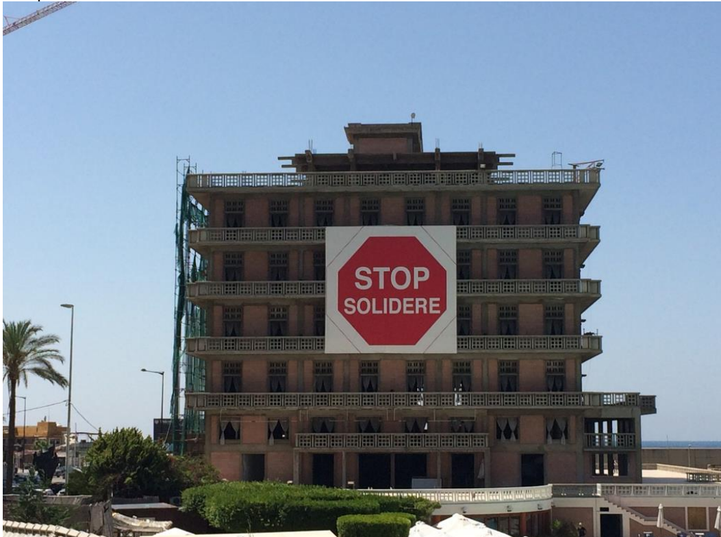
Figure 3. Poster on bombed building outlining campaign to stop the privatization of the city center.

More than 20,000 tons of uncollected rubbish amassed in Beirut during the summer of 2015. The problem of uncollected rubbish occurred as a result of the multi-ethnic power sharing failing to agree to extend the contract of the private company responsible for disposing the city's trash. In response, a newly formed protest movement – called "You Stink" – began a series of protests in Beirut city center where they demanded the government's resignation. Many protestors – reported as people from across the sectarian and political spectrum – carried placards, symbolic refuse bags and wore paper masks to cover the stench of the trash and what they viewed as the decaying political class. Tens of thousands of demonstrators were recorded at the city center protests, which were held on almost a daily basis. For You Stink's protestors, the issue of uncollected trash was symptomatic of the wider problems of dysfunctional, sectarian and corrupt governance. Indeed, in Lebanon the spoils of state are divvied up as lucrative contracts for public works are awarded to private companies with close ties to sectarian elites.