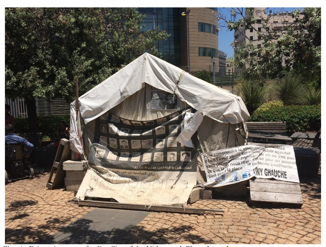
Figure 2. Tent in Beirut city center for Families of the Kidnapped.

Yet, given how reconstruction strategies entrench social forgetting to legitimate urban dispossession, resistance may also be articulated by social movements that cross-cut ethnic cleavages to create strategies of resistance to amnesia through right-to-the-city claims. Thus, right-to-the-city movements harness the power of memory, haunting, ghosts and history as a way of fostering peacebuilding and as a means to demand access to municipal services in the present. In particular, I link Lefebvre's right-to-the-city with the idea of ghosts and haunting, the strategy of making what is concealed – and thus used to legitimate sectarian division and economic injustice – visible and open to transformation. If postwar reconstruction expedites disappearance through amnesia, radical movements reveal what Arendt termed a "space of appearance", a sphere of political action where citizens coalesce to produce agency, power and collective action.