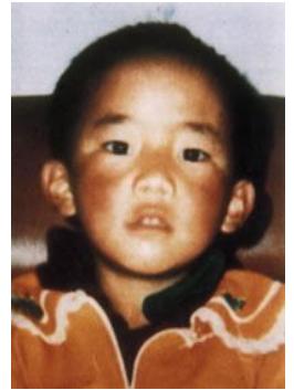
3: Gedhun Choeki Nyima, the Dalai Lama's choice

The consequences of such an action could be both grave and enduring – both for the exiled Tibetan movement and for internal security within the PRC. Regardless of claims by the PRC, there is no evidence that the Dalai Lama either instigates or co-ordinates 'splittist' or violent activities within Tibet such as the protests of 2008; indeed, the Dalai Lama's public advocacy of non-violence has clearly restrained the development of violent Tibetan nationalism both