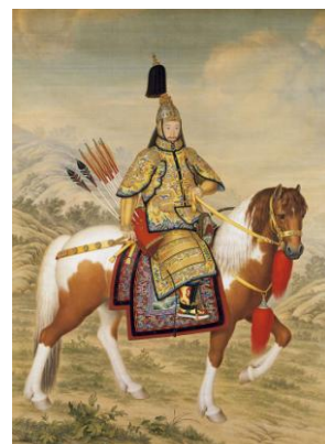
1: The Qianlong Emperor, 1739 or 1758, by Giuseppe Castiglione. The Palace Museum, Beijing.

Much of this situation changed with the Tibetan Uprising of 1956-9, and the flight of the Dalai Lama and much of his remaining government into exile in March 1959. The military suppression of the Uprising was followed by a vilification of the Dalai Lama, and Beijing sought to bring forward the initially more politically-compliant Panchen Lama as a replacement vi . However, when the young Panchen Lama wrote a 70,000 character petition criticising Chinese policies in Tibet in 1962, he too was vilified through extensive revolutionary 'struggle sessions', imprisoned until 1977, and did not re-appear in public life until 1982. The early 1980s constituted limited re-birth of Tibetan religious culture after the depredations of the Cultural Revolution years, and the politically-adept Panchen Lama was a critical figure in this renaissance; his premature and unexpected death in 1989 has been the object of considerable speculation, conjectures which have however been overshadowed by the politically disastrous events surrounding the recognition of his re-incarnation (see Focus , below).