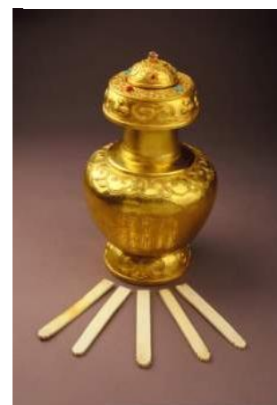
2: The Golden Urn