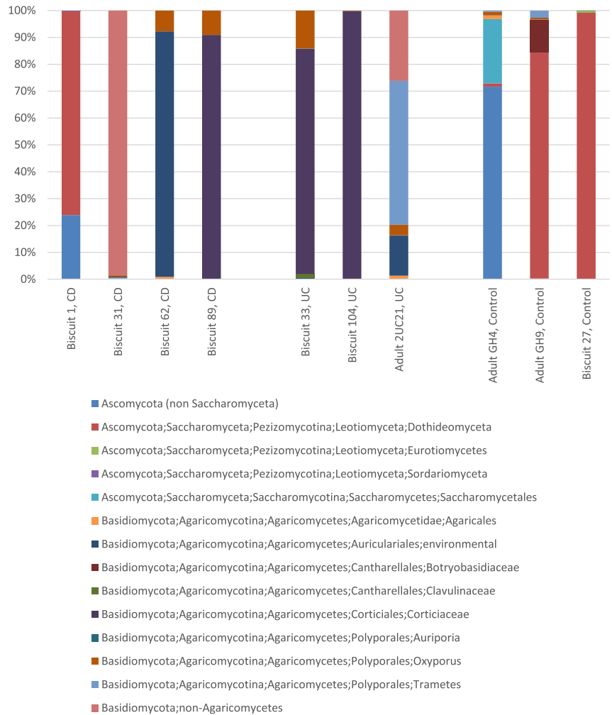
Fig. 2. Individual patient genus-level diversity assessment as stacked bars.