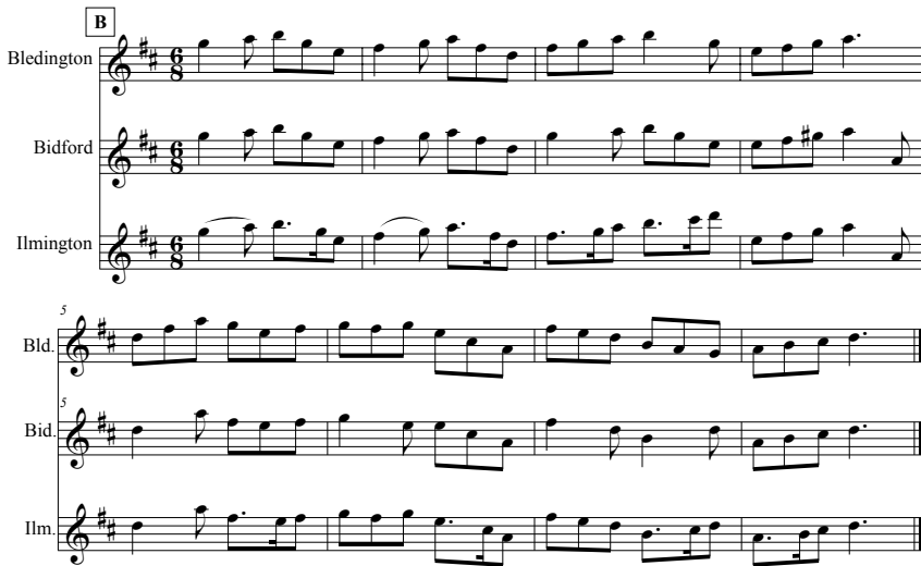
Figure 6 Extract from 'Constant Billy' showing raised note in Bidford rendition

'Constant Billy' is probably the most popular melody in the morris genre. There is a copy of it (but only the A section) in the Ferris MS (40), it was used in Ilmington and a version of it was known in Bledington as 'Billy Boy'. When all the renditions are lined up, there is very little difference between them, and what there is occurs on unstressed beats. Statistically speaking the Bledington tune differs from the Bidford tune in twice as many places than the Ilmington tune. The Bledington melody replaces the longer notes with passing tones and arpeggios. In five places Ilmington and Bledington use the same pitches, while Bidford uses a different one. Robbins raises the leading tone to the dominant in a certain stepwise run, where the