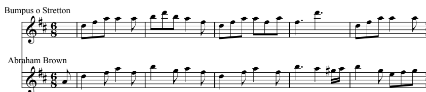
Figure 3 Extract from B section of ‘Bumpus o Stretton’ and ‘Abraham Brown’ showing limited range and fewer notes in the Bidford rendition

an Ilmington parody of the well-known song. ‘Bumpus o Stretton’ was only collected from Sam Bennett, who may have created the parody. 27 While the two tunes share many traits, the third and fourth bar from the end have no notes in common. The rhythm of ‘Abraham Brown’ is simpler, reflecting the unsung text of the original song (see Figure 3). Robbins opts for a narrower range than Bennett, avoiding both the low d ’ and high d ''''. Bennett played the Ilmington version in G, and this was transposed up to match Robbins’ key of D. The tune hints at the close relationship between the Bidford and Ilmington morris repertoires. Although it is in the same tune family as ‘Merrily Danced the Quaker’s Wife’, it does not appear in any guise elsewhere in the morris genre. This item was not listed on either programme.