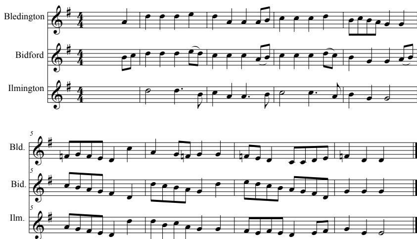
Figure 7 'Cuckoo's Nest'

This is another widespread melody, which can be very diverse in interpretation. Robbins' 'Cuckoo's Nest' only uses one strain of the tune, what is usually the B part in Britain. The A part is present in the Ferris MS, but the notation bears scant resemblance to what Robbins played. His tune is more closely related to the Ilmington version; yet again he avoids the minor mode. In bar 5, where the lines do not coincide, they follow the same contour, and Robbins continues this motif instead of following either of the other two lines very closely (see Figure 7). Judge suggested this tune came from Ilmington. If so, the tune diverged between Arthur's teaching and Robbins' and Bennett's performances.