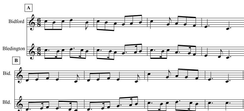
Figure 10 'Bidford Town Morris' / 'Hey Diddle Dis'

Judge wrote, 'In 1910 de Ferrars gave Sharp the tune for what he called "Bidford Town Morris", which may seem to indicate some kind of local connection for this dance.' 35 Judge surmises that because Ferris called this 'Bidford Town Morris' it may have been part of the original Bidford heritage. Despite its alleged local origins, it faded from the repertoire and was not collected by Carpenter, nor was it ever collected in Ilmington. Passing notes aside, the Bidford and Bledington renditions are nearly identical until the last three bars. In the penultimate bar there is again an example of the same melodic shape transposed down a fourth. As it is not a widespread melody, the close correspondence between the two variants may indicate that the music, at least, was heavily influenced by Bledington and adapted by Robbins (see Figure 10).