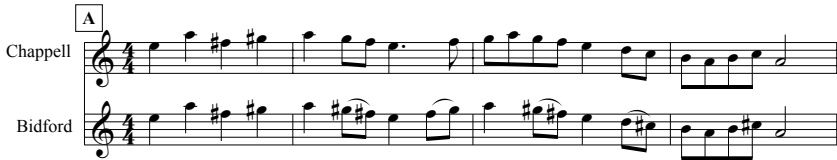
Figure 5 Extract from 'Bluff King Hal' / 'Staines Morris' showing altered modality

'Bluff King Hall' is the Bidford title for a tune more widely known as 'Staines Morris'. It did not occur elsewhere in the morris context until the 1950s. It was in the Ferris MS (40) annotated with the statement 'Handkerchiefs – arranged not genuine'. This item was created by Ferris, an old tune to which he added choreography. Judge believes Ferris acquired it from Chappell. 29 In comparing Robbins' playing with the Chappell version, it becomes apparent that he changed it from melodic minor to a major key (see Figure 5). The possible reasons behind this will be discussed later.