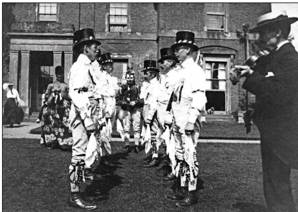
Figure 1 Bidford Morris Dancers, Redditch, Worcestershire, 8 August 1906.