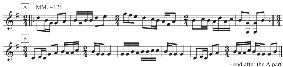
Figure 7 'Drops of Brandy' or 'Varaandi' as played by Ben Charlie 33

6. 'The Eight Couple Dance' ('Nihk'iidoo') and 'Mountain Rope' ('Neets'ee TI'yaa') I saw these dances done as a pair in Old Crow, both with eight couples, though Mishler says that neither the sequence nor the number of couples is fixed anymore. 34 I have not seen the first one done elsewhere, but the second is well-known on the Prairies as the 'Reel of Eight' or 'Old Reel of Eight'. 35 An asymmetric version of 'Arkansas Traveller' was the tune for the first in Old Crow ('Nihk'iidoo', see Figure 8), while the second was done to another D reel reminiscent of 'Whiskey Before Breakfast', at the beginning, but with a B part that seemed more like another variation of 'Arkansas Traveller' (see Figure 9). 36