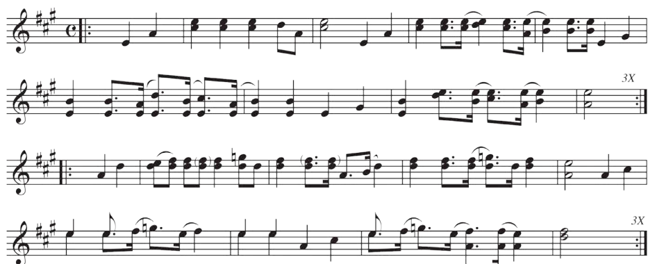
Figure 12 'Diggy Diggy Lo', as played by Ben Charlie 53