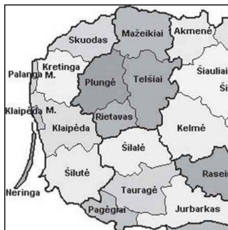
Figure 1 Map of West Lithuania

of playing. 4 During the last several years I have published some articles dealing with various problems of Lithuanian regional folk fiddle music. 5 In my opinion, the available folk fiddle music material (approximately 4000 audio or video music recordings dating back to 1908 and some manuscripts or manuscript notebooks dating back to 1858) 6 allows us to define the distinguishing features not only of Lithuanian regional styles, but in many cases also of local and individual fiddling styles.