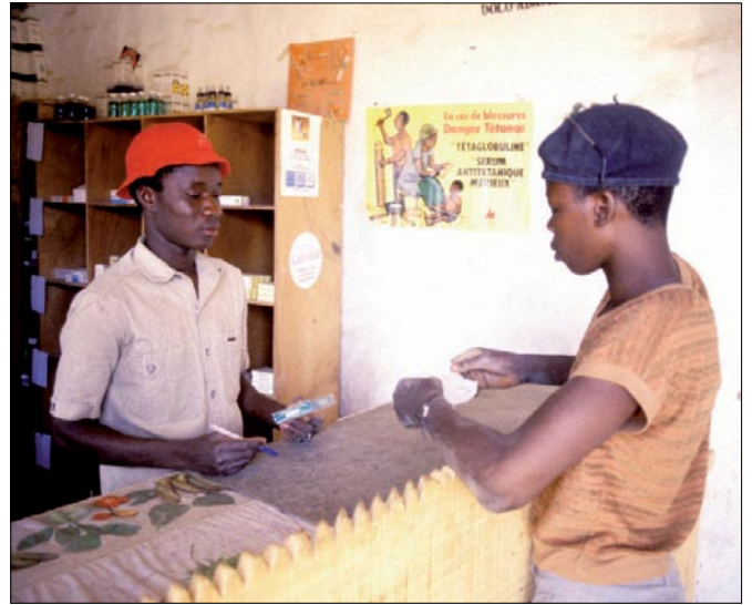
Pharmacist dispensing drugs to a customer at a village pharmacy in Burkina Faso.