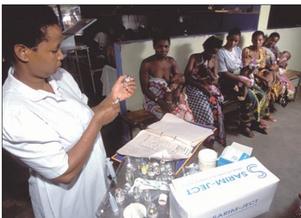
A nurse dispenses drugs to malaria patients in Kenya.

Strategies to remove or at least reduce demand side barriers, which disproportionately affect the poorest and most vulnerable in society, also need to be prioritised. Demand side barriers can include physical, financial, cultural and social barriers, such as opportunity costs, lack of knowledge about appropriate care, or distance to the health centre.